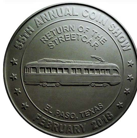
Photo: 2018 El Paso Streetcar club medal.

On sale at the ICCEP table was the club's 55 th annual show medal honoring the return of the El Paso Streetcar. Only a very few of the medals remain unsold.