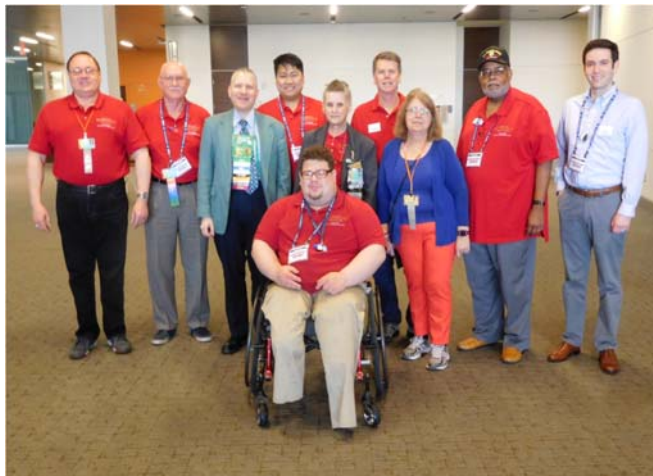
District Rep meeting attendees group photo at ANA National Money Show.