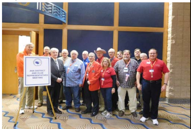
District Rep meeting attendees group photo at FUN.