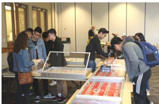
Students were excited to set-up their numismatic exhibits. Seven of the members were first time exhibitors.