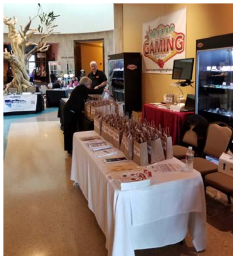
Additional similar MOGH displays, sponsored by the Casino Chip & Gaming Token Collectors Club, are presently on display at the Union Plaza Hotel Casino , the El Cortez Hotel and Casino and at the Mob Museum .

Visit the club's website at: http://museumofgaminghistory.org/ .