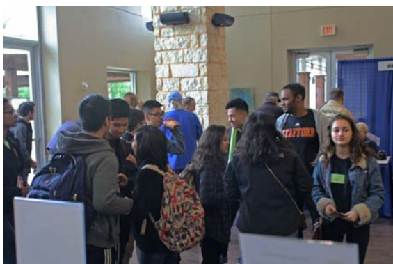
Spartans Coin Club entering the convention center. Members pre-registered for the coin show by email avoiding the wait in long lines.

Twenty-five eager students jumped off the bus, with exhibits in tow, and went to the ribbon cutting ceremony. After the ceremony they set up their exhibits, which were well received by show attendees. Several students got honorable mention for their display and all vowed to return again! Back at school the students were recognized for their awards and encouraged fellow students to join the Spartans Coin Club!